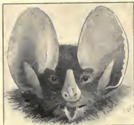
FIG. LXIX. OTOPTERUS WATERHOUSII . WATERHOUSE'S LARGE-EARED BAT.

3. Adult ♂ P. "Guadjara." E. Gerrard & Sons. (Alcohol.)